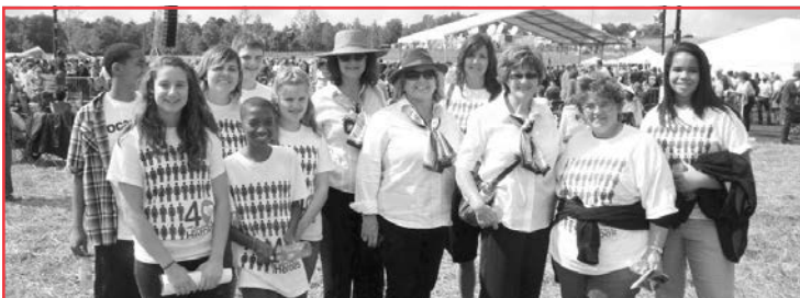
Heritage students and staff met United Airlines retired flight attendants, who lost friends and co-workers on 9/11/01.