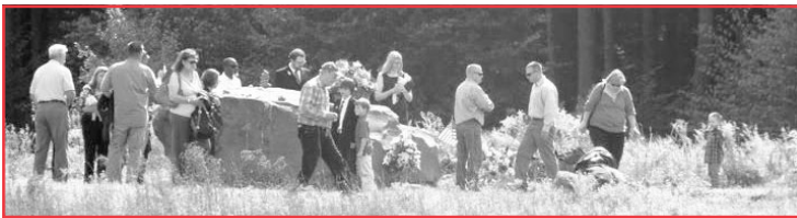
A 17-ton boulder marks the location of United Airlines Flight 93's impact. Family members of Flight 93 passengers and crew walked out to the crash site following the service.