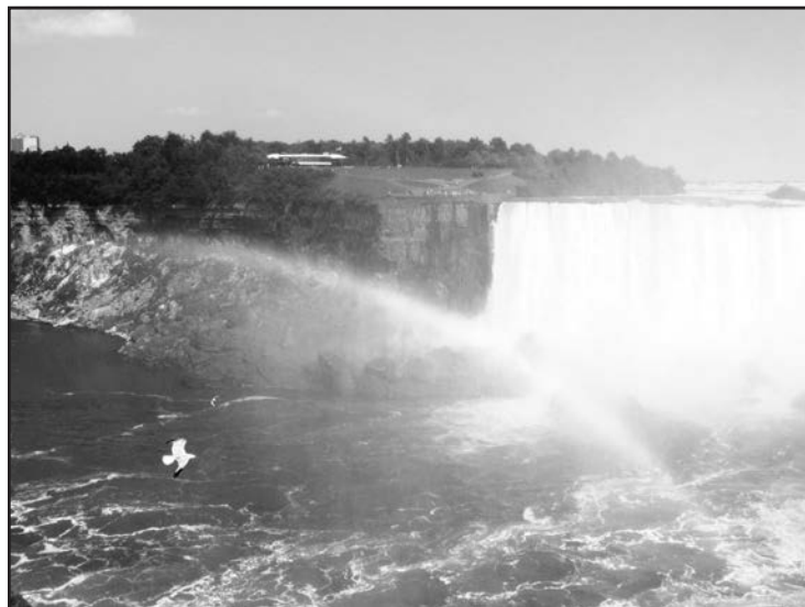
"Thanking God for His Promises" Fine Arts Festival 2011: Student musicians and artists will showcase their creativity with art and music that focus on water and rainbows in a celebration of God's promises to us.