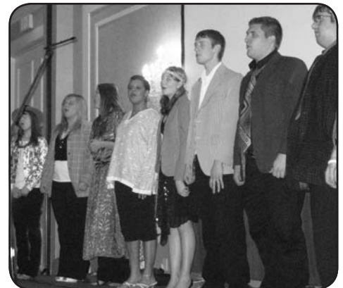
The high school choir performs a history of Christian music