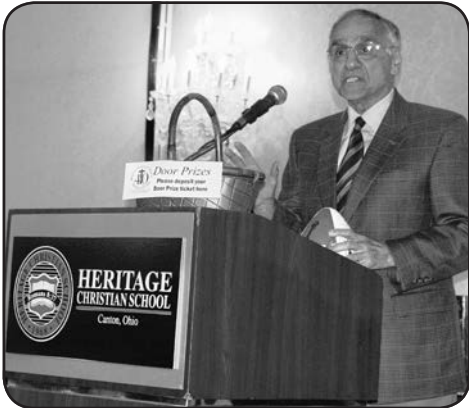
Former Browns coach Sam Rutigliano authenticates a Browns-signed football